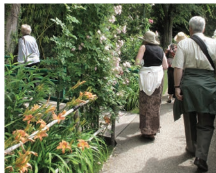
In Monet's garden, Giverny, France 2010

Fall 1988: "Both the recently scheduled trip to Great Britain and the Trough Workshop had to be cancelled for lack of sufficient participation," the newsletter reports with a touch of sadness. In future years, however, overseas trips, coordinated with the Federated Garden Clubs of Maryland, Inc., become a rousing success.