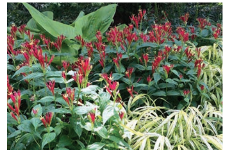
Spigelia marilandica , Indian Pink

January 2017: THE HORT REPORT publishes its first full-color issue, just in time to do justice to a Plant Profile picture of Spigelia marilandica , Indian Pink.