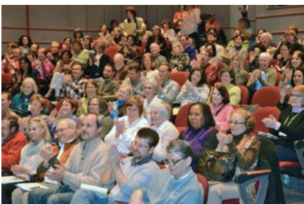
2014 Winter Seminar at Sheppard Pratt