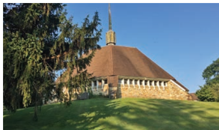
First Christian Church in Roland Park

Oct. 1, 1970: First Christian Church, 5802 Roland Avenue, becomes the venue for Society lectures. It will remain so for more than two decades, followed by the Church of the Redeemer (1998-99), Trinity Assembly of God in Lutherville (1999-2000), the Conference Center at Sheppard Pratt and the Three Arts Club (2001), Loch Raven High School (2002-05) and Towson Unitarian Universalist Church (2005-10).